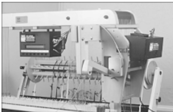
Figure 3. Close-Up of Compu-Dobby