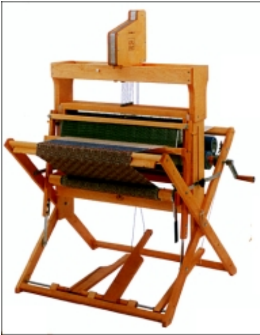
Figure 1. Schacht Floor Loom with Dobby