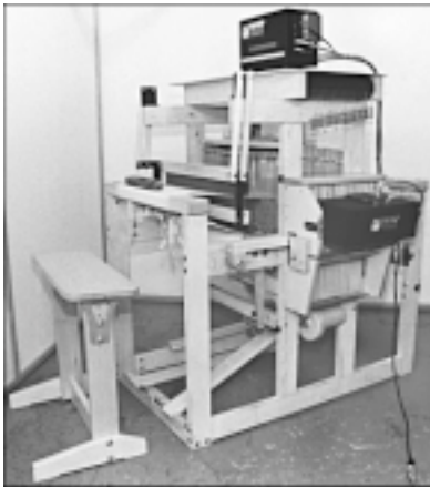
Figure 2. AVL Compu-Dobby Loom