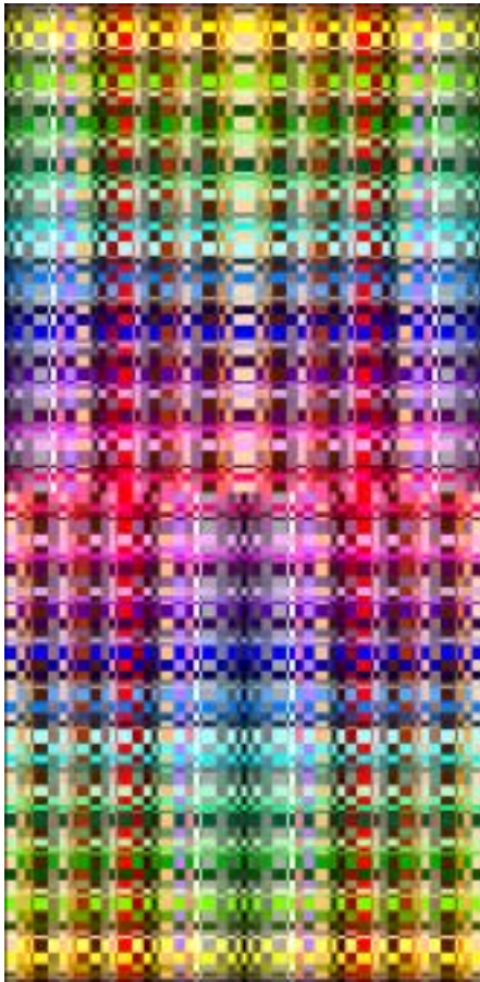
Figure 6. A Weavable Color Pattern.